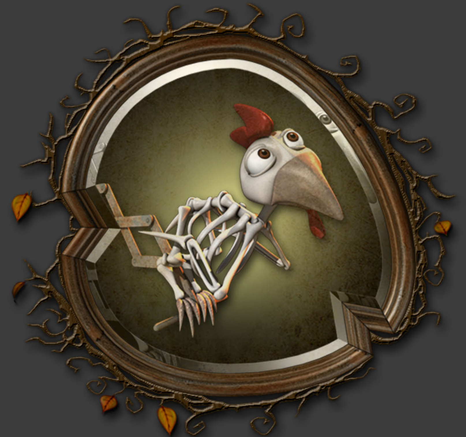
Bucklewhee (bean counter)

A young witch without a license. Miss Plim is tall, headstrong and extremely unruly. She bites, swears, steals and fibs. But when it comes down to it, Miss Plim defies every danger and picks every lock.