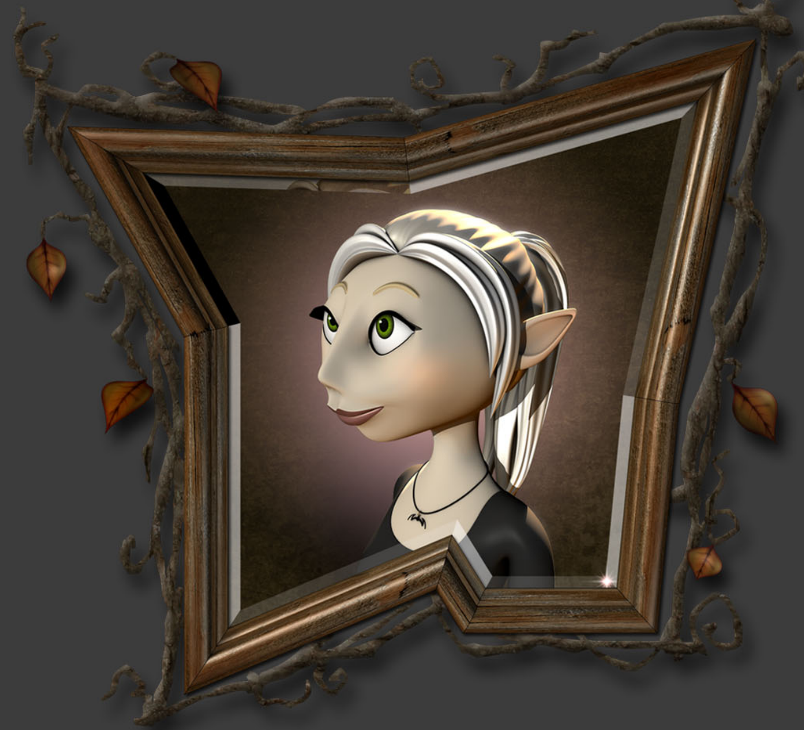
Miss Plim (illeg. herbal witch)

A pale boy with deep-set eyes and alchemical ingenuity. Immortalized by an ancient incident, he lives among the pages of books, mysterious memories and strange dreams. Formed, clever and always in search of the truth.